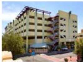
Pennington Street Garage

WITH MORE THAN 9,000 public parking spaces in garages and lots, and more than 1,800 metered spaces on streets, parking in the downtown Tucson area is easy. Metered and hourly garage parking is more affordable than in almost any other U.S. city, and the metered street parking is free on weekends and after 5 p.m. on weekdays.